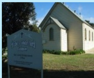
St Canice's Lindenow